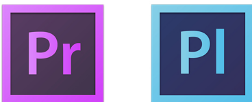
Adobe Premiere Pro and Adobe Prelude